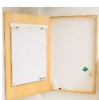
Whiteboard conference cabinet