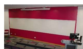
Full Width boards