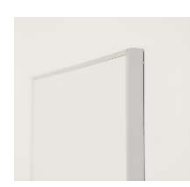
Hush Acoustic Whiteboard