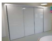
Sliding door boards