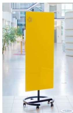
Mobile Glass writing board