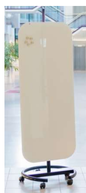
Mobile Radia Glass writing board