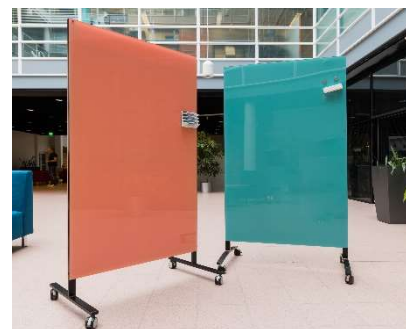
Mobile Glass writing boards